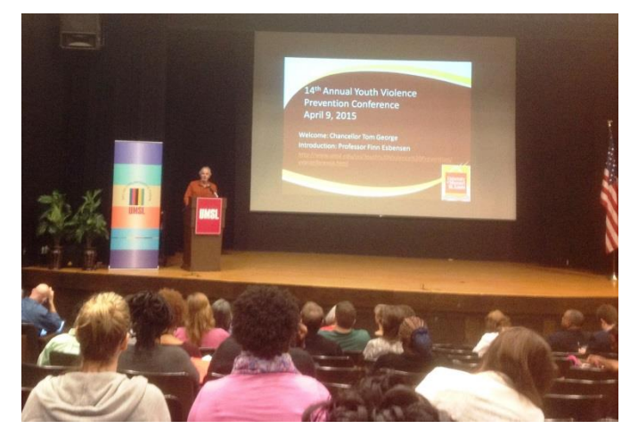
Finn Esbensen welcomes conference participants